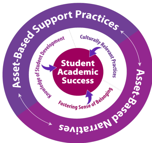
Figure An Equity-Based Framework of Support

Note. This figure demonstrates how the connection between student development, the reframing of deficit ideology, and culturally relevant pedagogy influence sense of belonging and student academic success.